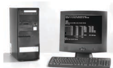
Standard CFN III PLUS Manager Configuration

For more information, contact your local Gasboy distributor.